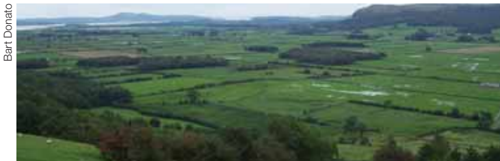
Lyth Valley, Morecambe Bay

We will be funding a 'Managing wetlands at a landscape level' workshop in the autumn.