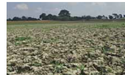
The response of wetlands to increasing drought frequency will be examined in the climate change project

For more information contact: ann.skinner@environment-agency.gov.uk