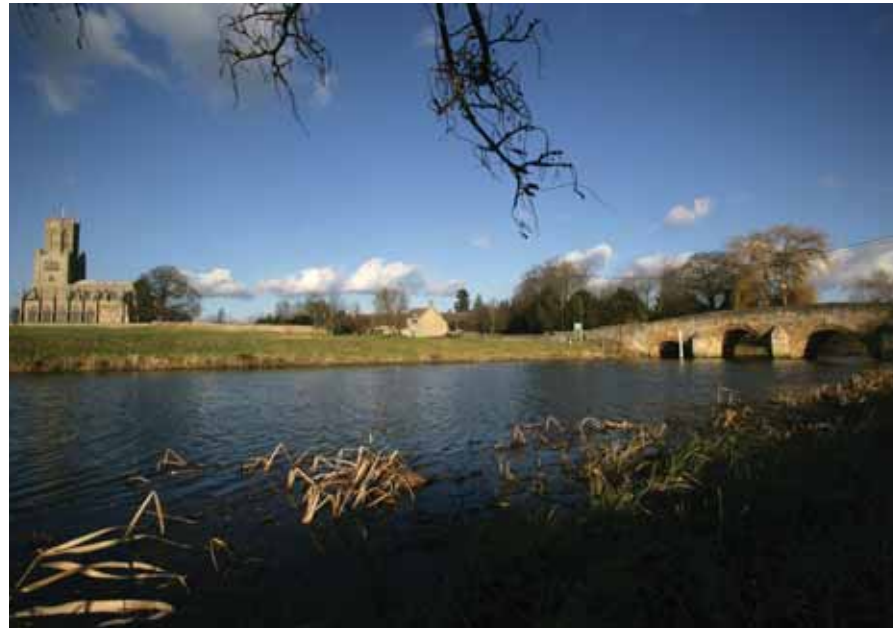
River Nene (East Anglia)