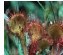
The Wetland Vision partnership is continuing to work together for the future of our wetlands, their habitats and species and the services they provide