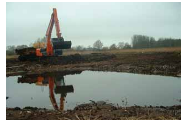
Wetland creation under the Million Ponds Project

If you are interested in creating clean water ponds or ponds for BAP species, please visit: www.pondconservation.org.uk/millionponds