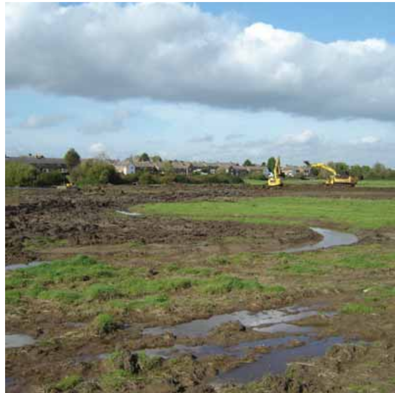
Worcestershire Wildlife Trust

Transcripts of the workshop discussions can be found in the download section of the Wetland Vision website www.wetlandvision.org.uk